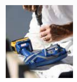
1. Remove the cover with a screw driver.

Depend on the durable, lightweight, and full tip support Triax<sup>™</sup> triple piston pump — built from durable stainless steel and carbide components, and using ProConnect for a modular, drop-in on-the-job pump replacement.