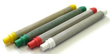
Atomex Push In Gun Filter Recommendation for Atomex X-50CT Contractor Tips

Designed for fine finish applications such as gloss acrylic, gloss oil based and stains where high quality finish is desired with less overspray. Larger sizes can be used for spraying ceiling white and low sheen acrylic on walls for superior finishes at lower pressure with less overspray.