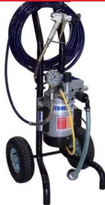
Upgrade Deal 2