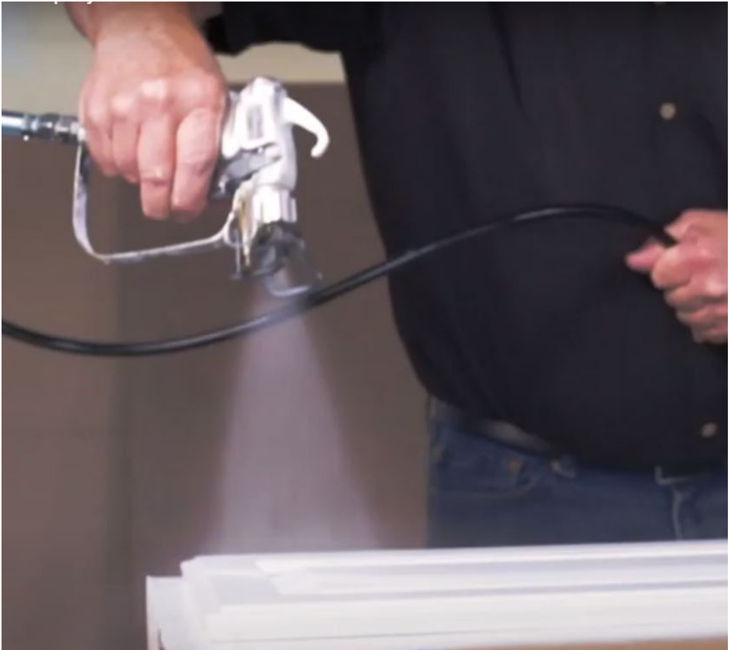
Popular accessories used with the Atomex GM-20E – Atomex X-50CT Contractor Airless Spray Tip