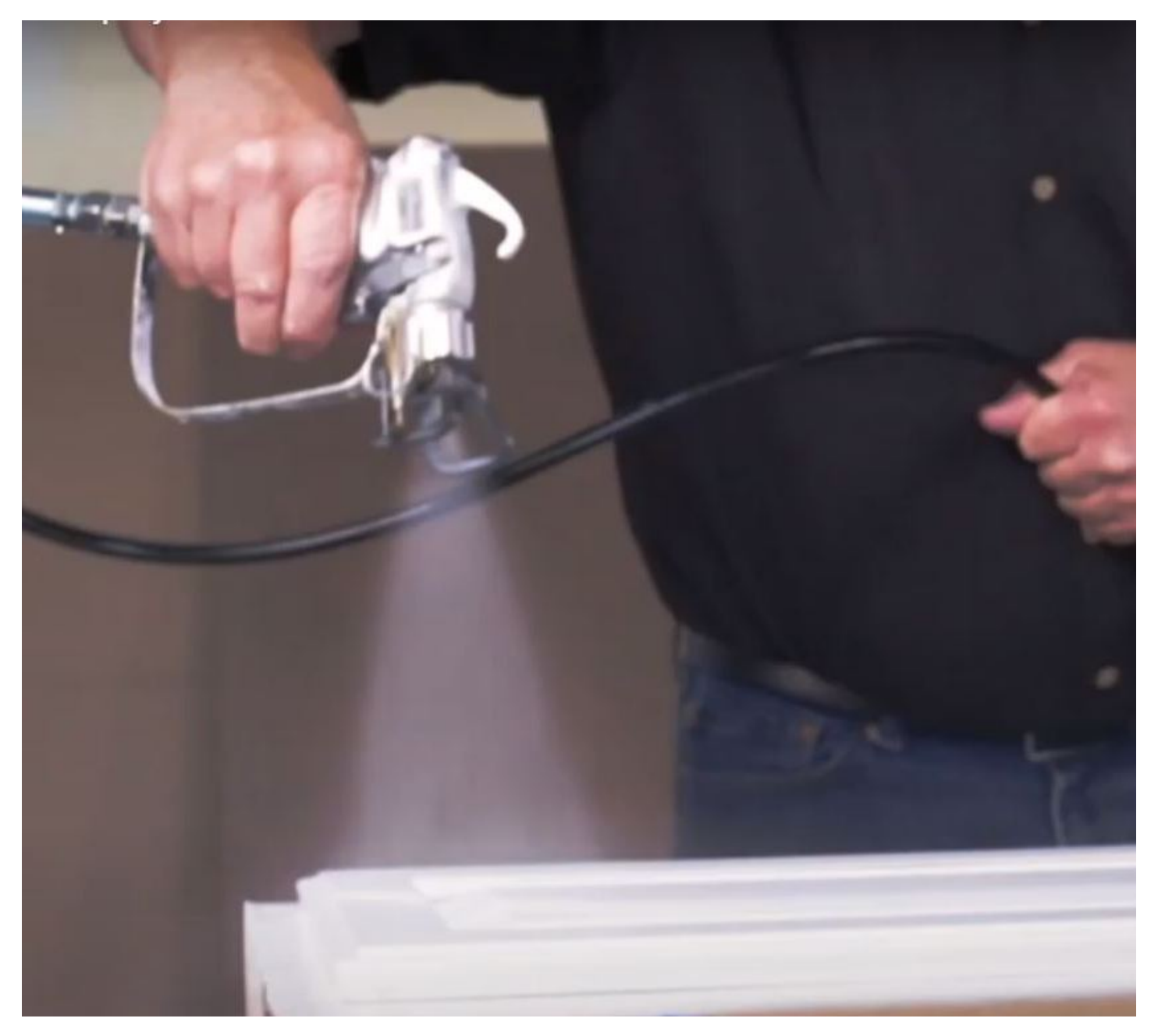
Popular accessories used with the Atomex GM-20E -